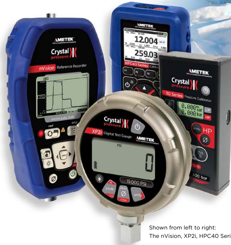
Shown from left to right: The nVision, XP2i, HPC40 Series, and 30 Series.

Our JOFRA dry-block temperature calibrators are the fastest solution available for accurately calibrating temperature. One high speed calibrator reduces test time while also offering automated, hands-off operation, allowing a technician to complete multiple tasks simultaneously. We even have a model that only requires calibration once every three years!