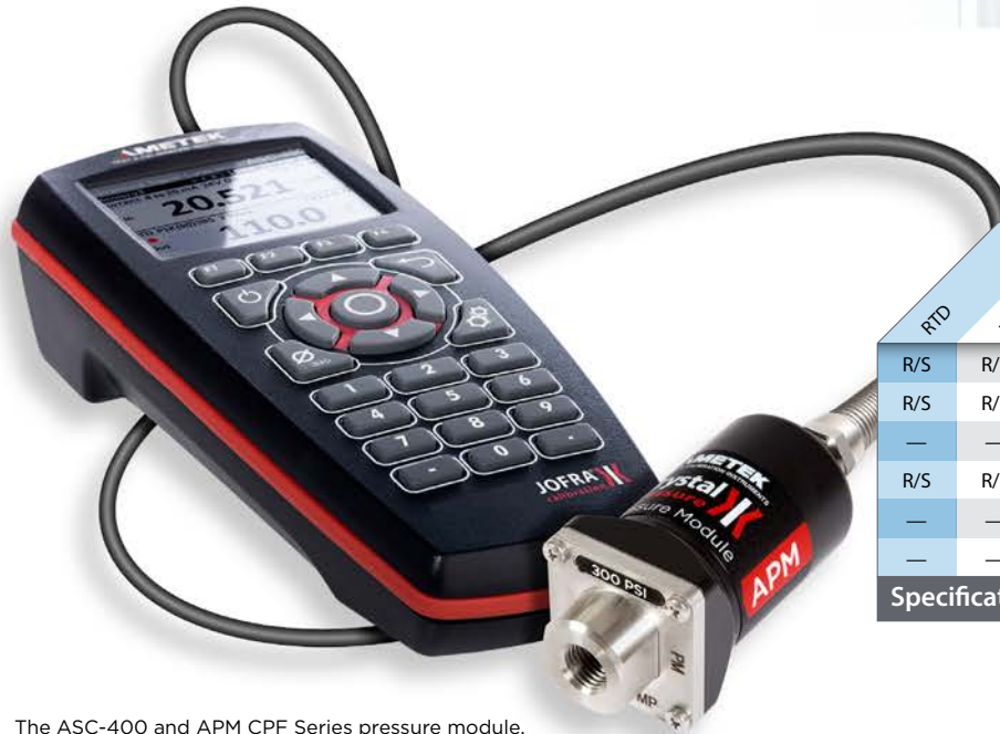
The ASC-400 and APM CPF Series pressure module.

If you don't need the advanced features found in our multifunction calibrator, our single task instruments, including the mAcal, CSC Series, and 24VDCPS, make calibrating instruments like pressure transmitters fast and easy.