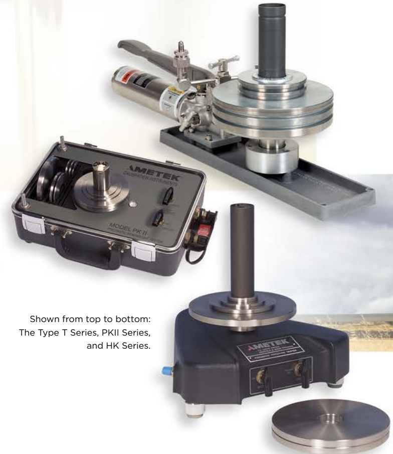
Shown from top to bottom: The Type T Series, PKII Series, and HK Series.