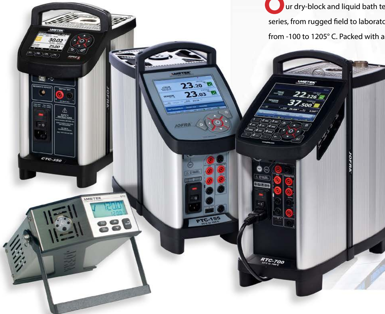
Shown from left to right: The ETC, CTC, PTC, and RTC.